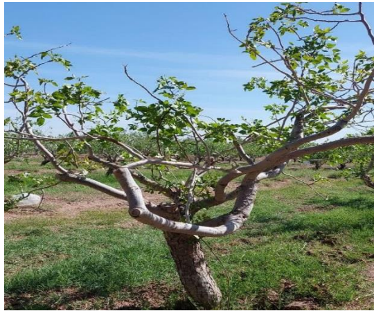
Fig.1. Image of pistachio tree labeled as Ohadi2 which transcriptome of 26 was retrieved from its total RNA (BioSample SAMN11242392 , accession number SRR8772759). This tree is located in the germplasm collections of the Iranian Pistachio Research Institute (Rafsanjan, Iran) and shows symptoms including dieback, yellowing, and decline.

Fasterq-dump (SRA Toolkit, version 2.10.7) was utilized to convert downloaded SRA files to fastQ format [12]. The raw reads were filtered to remove the failed or low-quality reads using the Fastqc (Version 0.11.9) and Trimmomatic (version 0.36) programs [13]. Qualified reads were mapped on the P. vera reference genome (ID: 55403), downloaded from NCBI using Hisat2 (version 2.2.1) [14], to filter out plant RNA sequences. The remaining sequences after removing the reads of plant RNAs, were assembled de novo into contigs using MEGAHIT (version 1.2.9) [15]. Contigs were